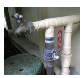
Main water shutoff valve example

A. In case of an emergency, such as a burst pipe, quickly close the main water shutoff valve to prevent flooding. Your main water shutoff valve controls all of the water coming into your house. Everyone in your home should know where the valve is and how to turn it off. Often it is connected to a hose bib near the front of your home.